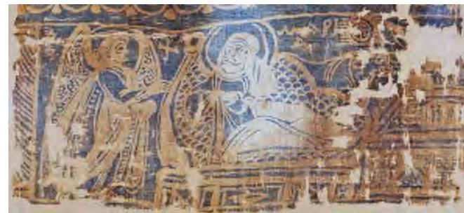
Nativity Scene, resist dyed linen, Akhmin, 4 th century, © Victoria and Albert Museum, London

For further details email < Philippa.adrych@magd.ox.ac.uk >, or visit https://empiresoffaith.com