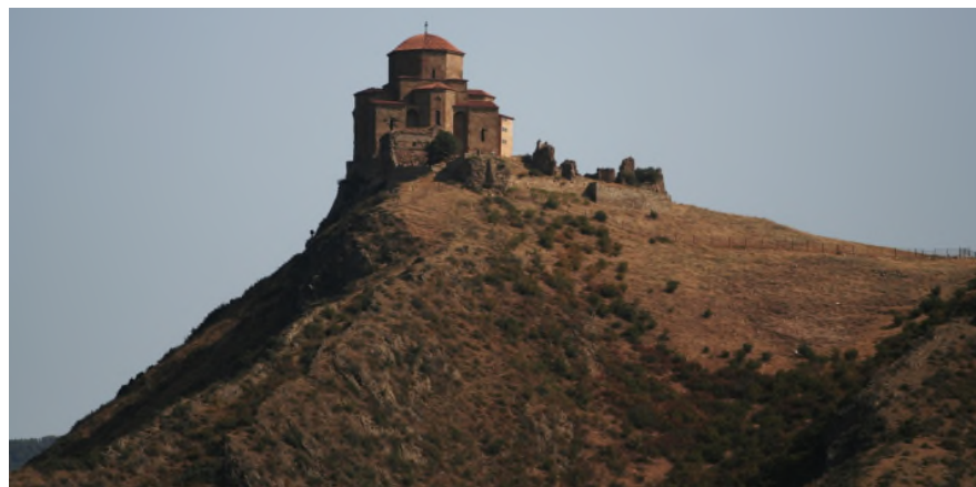
Jvari monastery, Mtsketa