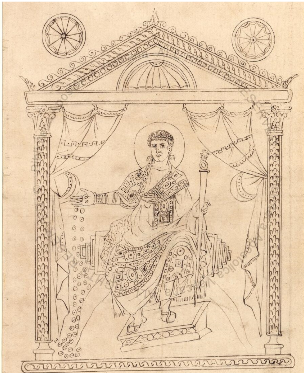
Constantius II in consular dress. Chronography of 354