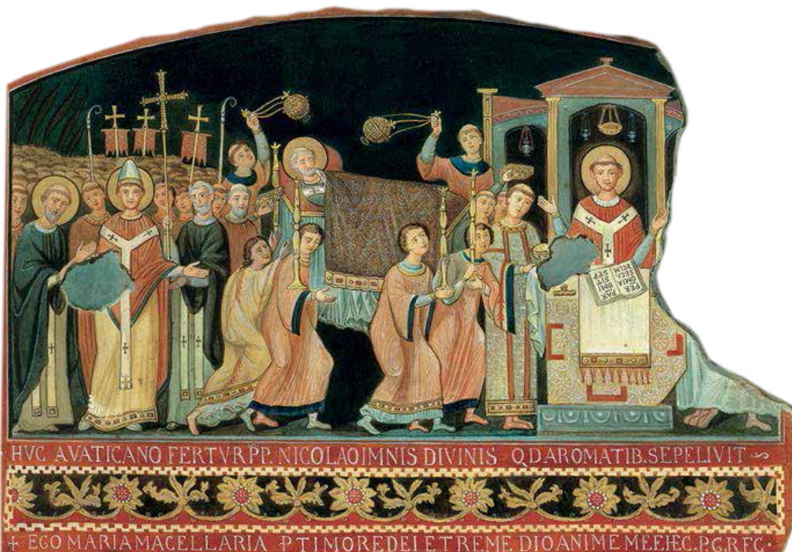
Rome, San Clemente. The relics of St Clement are brought to Rome from the Crimea

Religious cults can be affected, transformed, or even obliterated by their transfer from region to region. The cults of saints and their related customs, legends, images, and relics, could travel away from their place of origin, following waves of migrations or networks of ecclesiastical, political, social, and commercial contacts. Transfer could transform a cult, or affect indigenous cults through their contact with imported ones. This workshop will examine the paradigm of cult transfer as a historical tool for our understanding of literary transformation in Byzantine Greek hagiography and its related linguistic traditions, in all its different manifestations.