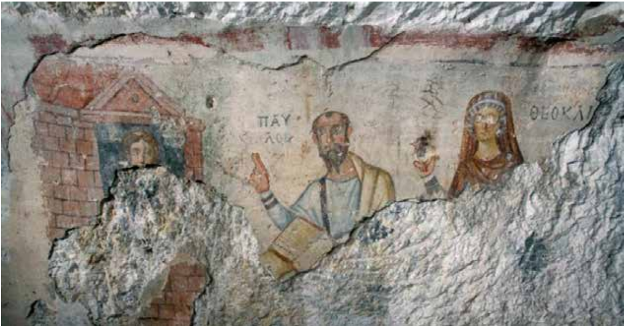
Wall painting from Ephesos depicting Paul and Thekla